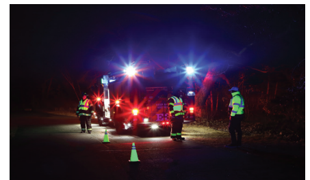
Environment with added short wavelength light