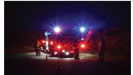
Environment with low lighting